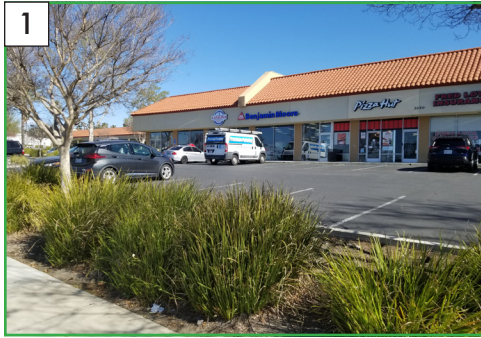
Los Angeles Avenue