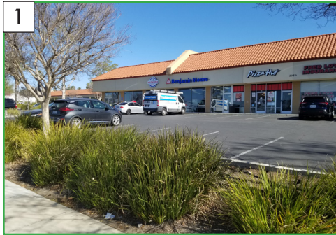
Los Angeles Avenue